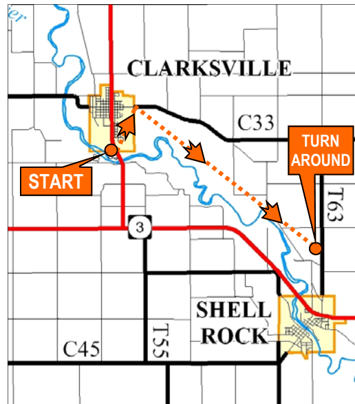
Ride is approximately 6 miles each way on the paved Rolling Prairie Bike Trail

Serving Black Hawk, Bremer, Buchanan, Butler, Chickasaw and Grundy Counties.